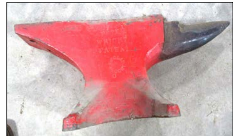
Mrks "120/0/16" - Lot #3