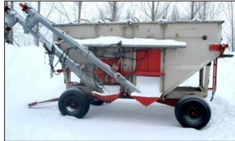
Hyd. Augers, Needs Work-Lot #11