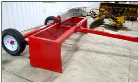
w/Cyl. -Lot # 7