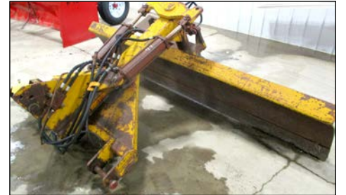
w/Cyl. -Lot #6