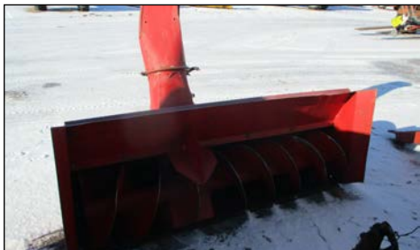
540 PTO - Lot #8