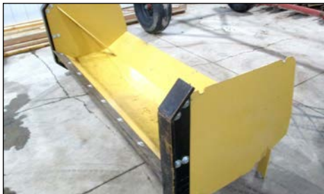
Univ. Loader Mount- Lot #10