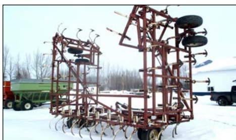
No Harrows - Lot #13