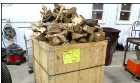
Will help load - Lot #1B