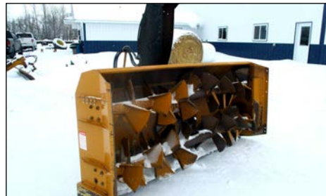
2 Stage, Hyd., Lrg 1000 PTO - Lot #9