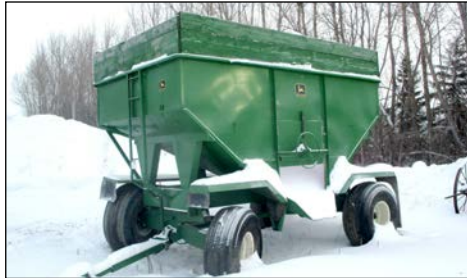
16.5X16.1 Tires-Lot #12