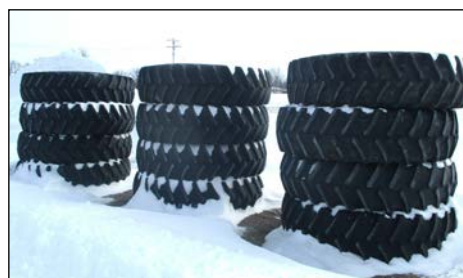
25% - Lot # 2A1-2A4