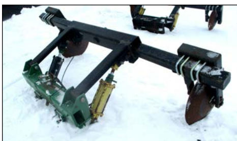
w/hyd. cyl. - Lot # 4A, 4B