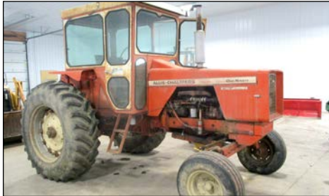
2 Hyd., 3 pt., 5,827 hrs., - Lot #14