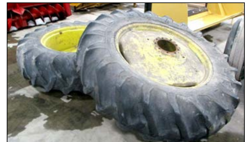
w/Hubs - Lot #2B